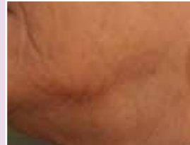
1 month post 2 treatments