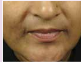
Post 4 treatments

Unlike light-based corrective treatments, Sublative works on virtually all skin types.