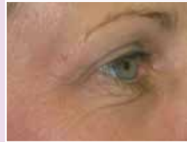
6 weeks post 3 treatments